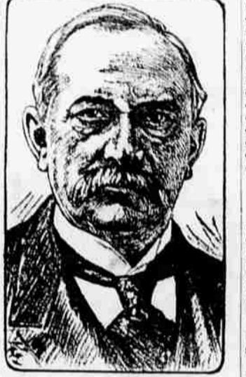
JOSEPH BENSON FORAKER.

the reviewing stand they were bombarded with flowers by the women of Toledo, and emerging from the floral shower they were greeted by an immense human flag made up of nearly three thousand children. The old soldiers saluted the picture and many waved hats and hands.