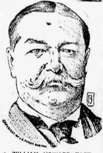
WILLIAM HOWARD TAFT.