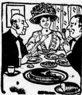
A NICE LITTLE MEAL AT THE THEATRE CAFE

is always appreciated, where you get everything so appetizing and toothsome these June mornings, when your appetite is fickle. When you want to treat your friends, your wife or your sweetheart to a meal that is cooked to the Queen's taste, bring them to the Theatre Cafe.