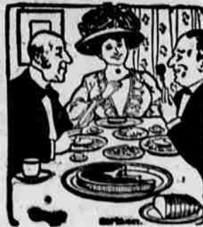
A NICE LITTLE MEAL AT THE THEATRE CAFE

is always appreciated, where you get everything so appetizing and toothsome these June mornings, when your appetite is fickle. When you want to treat your friends, your wife or your sweetheart to a meal that is cooked to the Queen's taste, bring them to the Theatre Cafe.