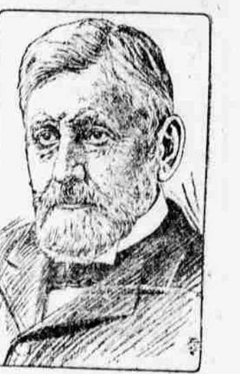
WILLIAM R. ALLISON.

Dubuque, Aug. 5.—As he lived, so was Senator Wm. R. Allison buried today in a manner devoid of all ostentation. The services were held at the residence of the dead statesman, and while not of a private character, the limited accommodations of the home permitted only the presence of distinguished visitors, relatives and