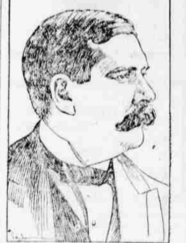
J. P. DOLLIVER. Iowa senator who might have had the Republican nomination for vice president had he desired it.