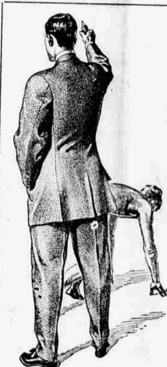
Copyright 1908 by Hart Schaffner & Marx

Nazareth Union Suit Waist Just the best undergarment for children yet; Nazareth with the best shaped drawers attached, the suit ..... 50c