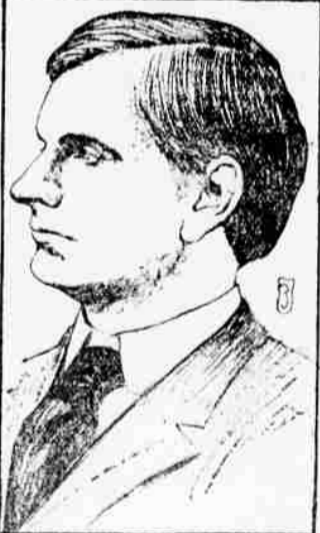
THOMAS P. GORE. Oklahoma senator who has just been renominated by the Democrats to succeed himself.