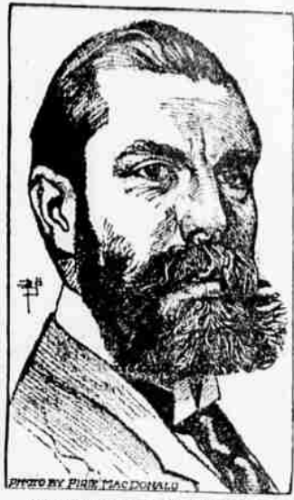
CHARLES EVANS HUGHES.

July 31.—Judge Taft is free from politics today. He has constituted his plans for the coming year. Letters of congratulatory messages were received from Minnesota before his speech of acceptance.