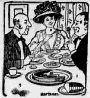
A NICE LITTLE MEAL AT THE THEATRE CAFE