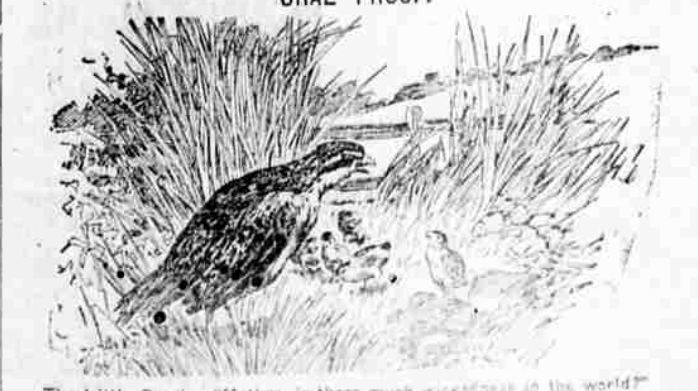
The Little Quail: "Mother, is there much work in the world?" The Mother: "Get in front of a man when he has a shell caught in his gun and see."

Every Woman (Interested and should know about the wonderful MARVEL Whirling Spray.)