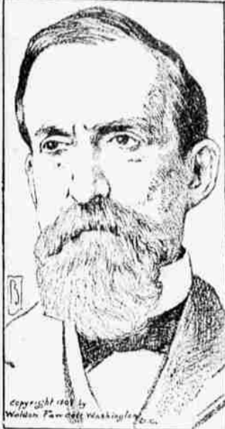
JOHN W. KERN.

Denver, July 10.—The drift to John W. Kern for vice president was so rapid that other candidates withdrew as the roll of states was called, and the Indiana man was nominated by acclamation. Denver, July 10.—After the terrible strain of an all-night session a majority of the delegates slept late today. There were several lightly attended conferences in regard to the