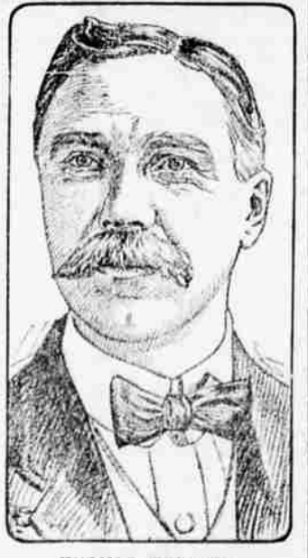
THOMAS TAGGART, Chairman of the Democratic national committee, who probably will seek reelection.

Grand Junction, Colo., July 3.—That a conspiracy has been formed to start a riot during the Fourth of July celebration at Telluride, which