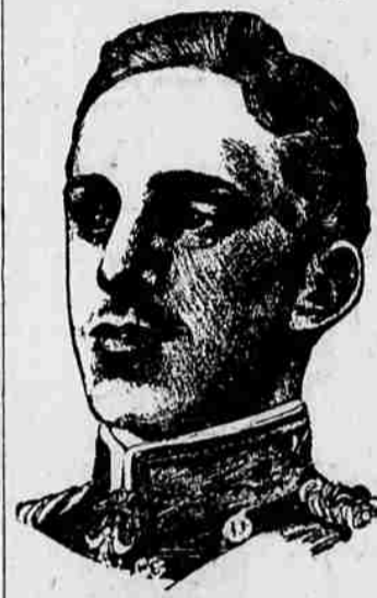
KING ALFONSO XIII. OF SPAIN.

Queen Victoria was formerly the Princess Ena of Battenburg, and is a granddaughter of the late Queen Victoria of England, being the daughter of the Princess Beatrice and the late Prince Henry of Battenburg.