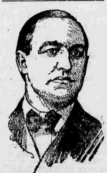
JOHN MITCHELL.

Chicago, June 21.—President Gompers, John Mitchell and other leaders of the American Federation of Labor are angry, gloomy and rebellious over the federal court injunction plank adopted by the convention.