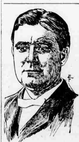
WILLIAM E. BORAH.

"When Massachusetts was reached, its chairman seconded the nomination of Sherman.