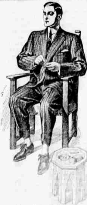
Copyright 1908 by Hart Schaffner & Marx

Hampton Bros. 558-564 Willamette St. WHERE CASH BEATS CREDIT