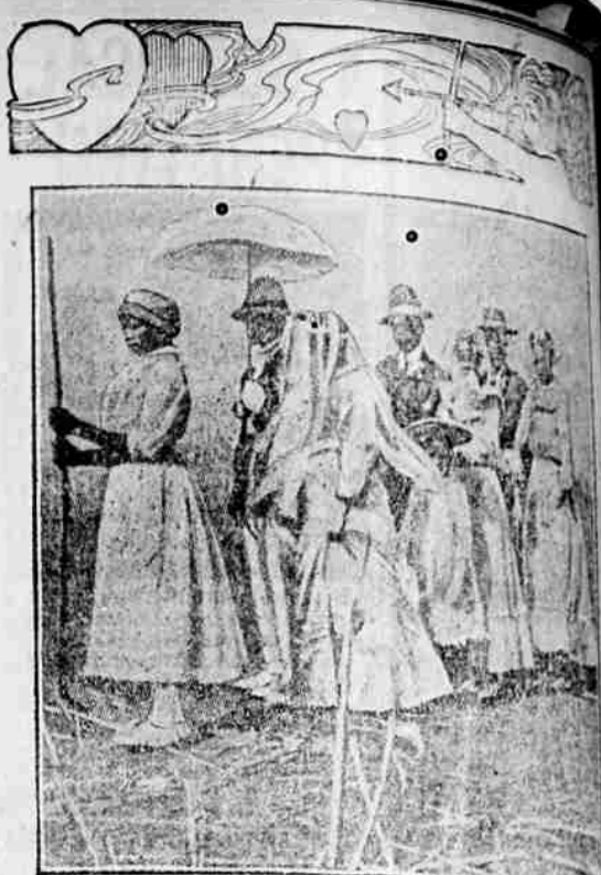
A KAFFIR WEDDING PARTY.