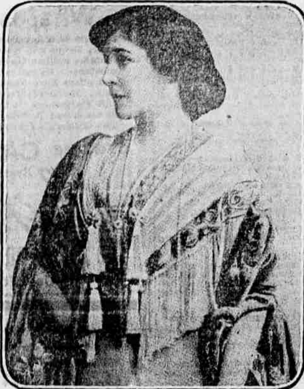
MRS. LANGTRY IN A NEW ROLE.