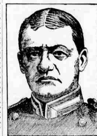
REAR ADMIRAL EVANS.

San Francisco, May 6.—The first of the functions connected with the coming of the Atlantic fleet was a breakfast given in honor of the secretary of the navy, Victor H. Metcalf. About fifty guests assembled in the red room of the St. Francis hotel, including Secretary Metcalf, the governors of several states, executive and reception committees, and the California Promotion Committee. Governor Sheldon, of Nebraska, presented to Secretary Metcalf a monster petition signed by officials and commercial organizations of Washington, Oregon, California, Idaho, Nevada, Utah, Arizona, Alaska, Hawaii and the Philippines, representing the sentiment of 280,000 citizens, asking for the permanent establishment of a fleet in Pacific waters of twelve battleships.