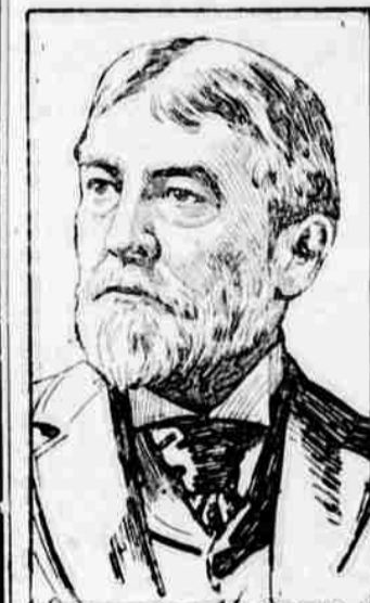
SENATOR EUGENE HALE.

Hong Kong, April 8.—The Chinese merchants' guild has decided to cable their agents at Japanese ports not to place any more orders for Japanese goods and to ship the goods already ordered in vessels other than Japanese. This boycott is the outcome of the Tatsu Maru incident.