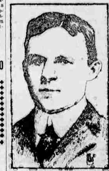
JOHN J. McHENRY, Manager of the New York National League baseball club, who won the fight of his life for the 2000th day.

Washington, April 8.—The senate committee on public buildings and grounds has approved the bill for $200,000 for a postoffice building at Everett, Wash.