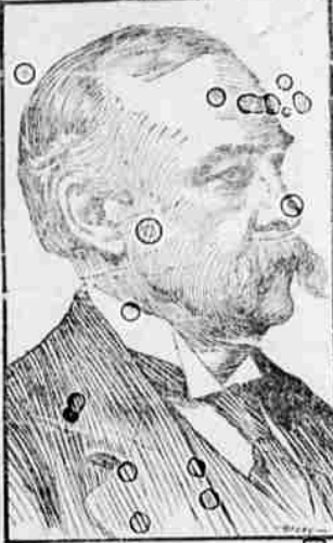
JUDGE GEORGE GRAY, Delaware Democrat who is prominently mentioned for the presidential nomination.