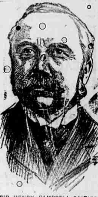
SIR HENRY CAMPBELL-BANNERMAN.

London, April 6.—Great Britain tonight in a peculiar position, being without a premier or ministry. The long-expected resignation of Sir Henry Campbell-Bannerman, the prime minister, was officially announced. According to the court circles he resigned on the urgent recommendation of his medical advisers, and as the constitution provides no automatic successor, it resting with the king to choose the new head of the government, and as in accordance with the custom and precedent, the whole cabinet resigns with the premier, a step to appoint a new minister can be taken until Herbert H. Asquith, chancellor of the exchequer, who has been summoned to Biarritz for the purpose, has seen the king.