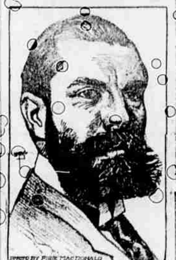
CHARLES EVANS HUGHES. New York's entry in the race for the presidency and the man who is supposed to be Secretary Taft's strongest competitor.