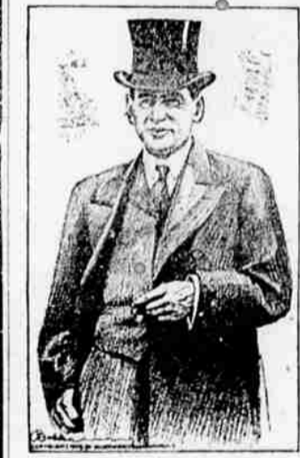
GOVERNOR JOHN A. JOHNSON, Minnesota executive who, next to Mr. Bryan, is the most prominent man in the race for the Democratic nomination for president.