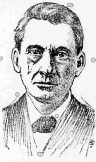
THOMAS E. WATSON.