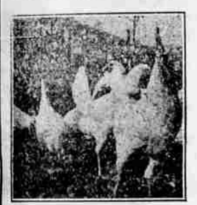
S. C. WHITE LEGHORNS.

Get the Thorough Bred S. C. White Leghorns for layers. They are the best