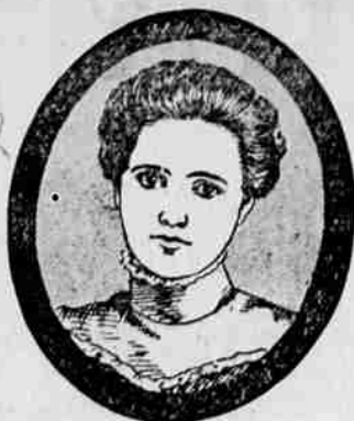
This woman says Lydia E. Pinkham's Vegetable Compound saved her life. Read her letter.

For 3 Days Ending Saturday Night We Will Sell the $3 Remle Soft Hat For $2.25. New Spring Styles Roberts Bros. Toggery