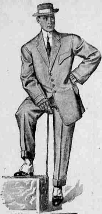
MODEL NO 9 Sophomore Clothes