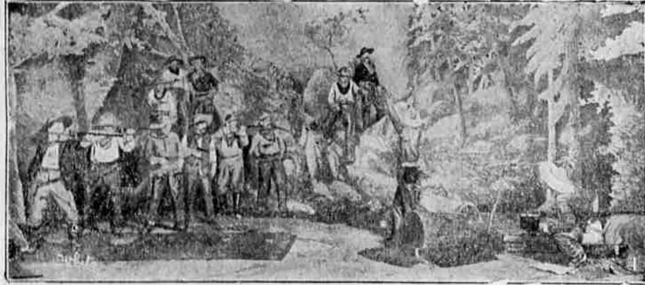
SCENE FROM "THE VIRGINIAN," AT EUGENE THEATRE MARCH 3