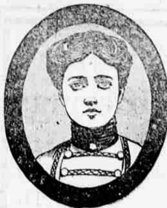
This woman says she was saved from an operation by Lydia E. Pinkham's Vegetable Compound.