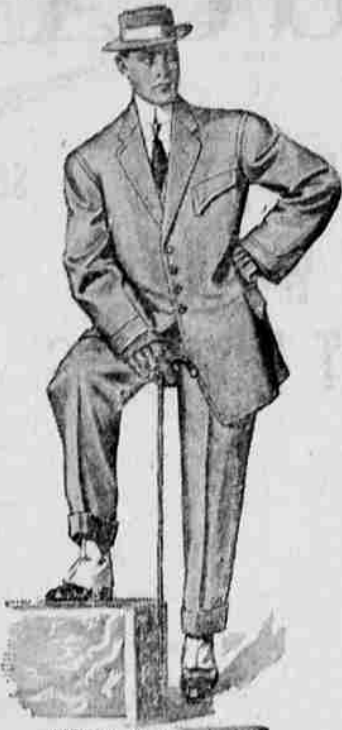
MODEL NO 9 Sophomore Clothes

New Furnishings Arriving Daily HATS AND CAPS STETSON SHOES DENT AND H. & P. GLOVES ..at..