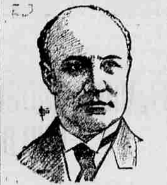
FRANKLIN K. LANE.

Commissioner Lane's report finds the existence of an extensive system of preferential rates granted certain shippers on interstate business by the Southern Pacific Company. The record discloses a list of 198 firms, corporations and individuals who enjoy the "special inside rates."