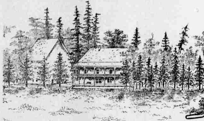
HOTEL AND BATH HOUSE

The wonderful resources of the Willamette valley are only just beginning to be realized. When we think of the hundreds of millions of feet of fine saw timber, the enormous mineral wealth, the unlimited water power, all undeveloped and awaiting the efforts of the enterprising business man to make his fortune, besides the unlimited possibility of the iron, and those suffering from blood disorders, general debility, skin diseases and catarrh, almost without exception are benefitted and cured. Many having gone there suffering from loss of vitality and nervous prostration have been cured and gone away strong and happy. Ponce de Leon, following his discovery of Florida, sought vainly for