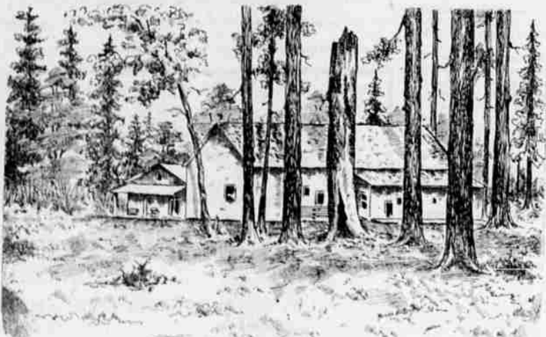
THE BOTTLING WORKS

Here also is located the bottling works where is bottled for an ever widening trade the waters of these celebrated springs, bottles being shipped in by the car load to meet the demands of the trade for the product. The water is unexcelled as a pleasant, refreshing drink, and as a remedy for chronic ailments it has no superior. In fact, many have found it a remedy for strong drink. It is a favorite as a bar water, excellent as a mixer and is sold everywhere. It is guaranteed to be an absolutely pure and natural mineral water, warranted to give satisfaction or money refunded.