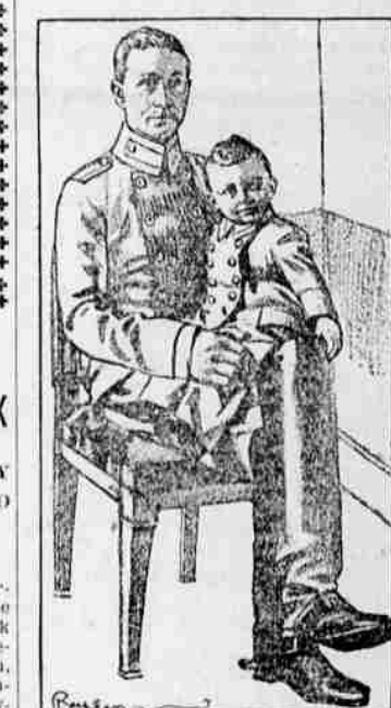
TWO GERMAN PRINCES. The German crown prince and his son, Prince William, who will train in the profession of a soldier.