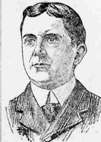
JUDGE VICTOR J. DOWLING. Jurist who is to preside at the second trial of Harry K. Thaw.

New York, Jan. 6.—A large crowd gathered about the criminal court building today to catch a glimpse of Harry K. Thaw, as he crossed the