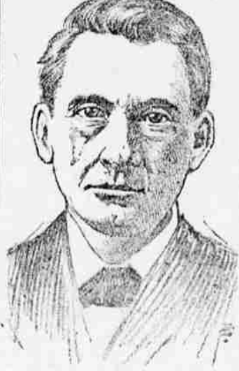
THOMAS E. WATSON. Popular leader who advised President Roosevelt to ban greenbacks.

Paris, Jan. 4.—The government is advised by M. Jusserand, French ambassador to Washington, that the