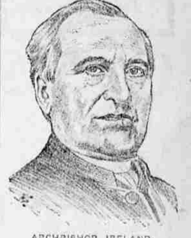
ARCHBISHOP IRELAND. Famous prelate who is a member of the Roosevelt industrial peace foundation.