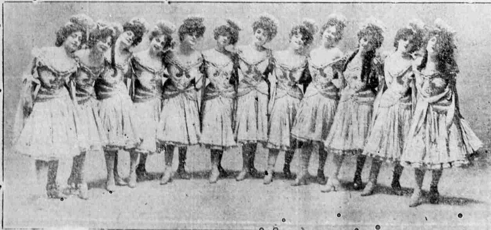
THE HENRY W. SAVAGE FAMOUS "LINE OF BEAUTY" IN HIS PRODUCTION OF "THE PRINCE OF PILSEN" AT EUGENE THEATRE