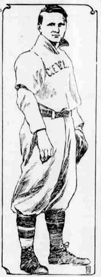
TERRY TURNER. The hustling shortstop of the Cleveland Blues.

The White Sox are making a desperate effort to retain the pennant, but they are not in as good condition as they were last year, while the rival teams are stronger. The Philadelphia Athletics, especially, have three excellent pitchers, with two