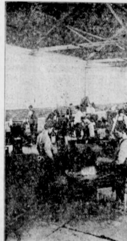
ONE PHASE OF INDUSTRIAL EDUCATION AT O. A. C.

THE WHEAT MARKETS Chicago, June 15.—July, 92 5-8; September, 90; December, 91. Portland, June 15.—Club, 78-79; Bluestem, 82-83; Russian, 76-77; Turkey Red, 78-79; valley, 80-81. Tacoma, June 15.—Wheat is unchanged.