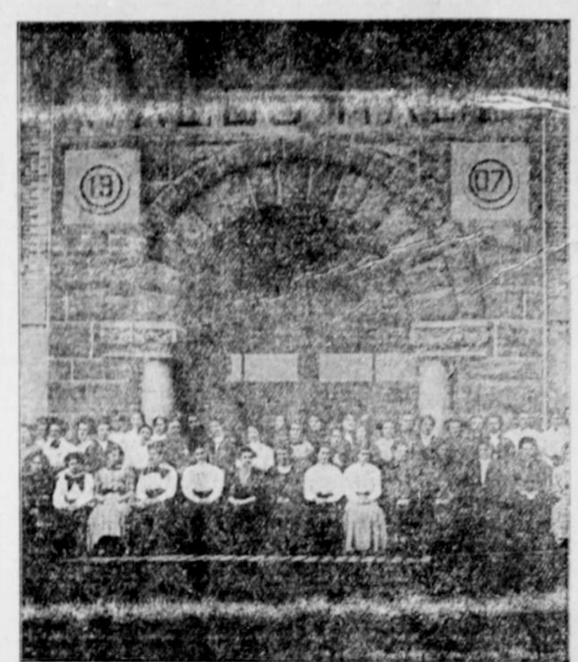
The O. A. C. Girls Who Were Prominent in the Celebration Exercises.