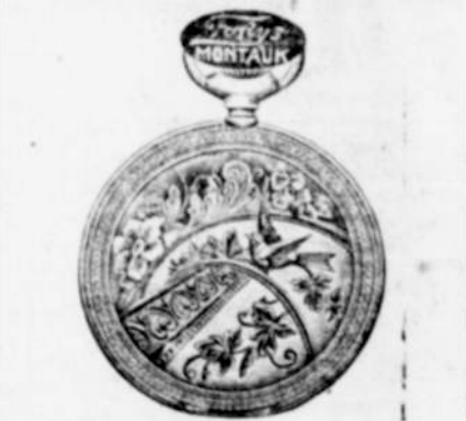
guarantee. See display window of Maurer & Coppennoll's Jewelry Store.

Contest closes February 26, 1910. OFFER CLOSES JAN. 29, 1910