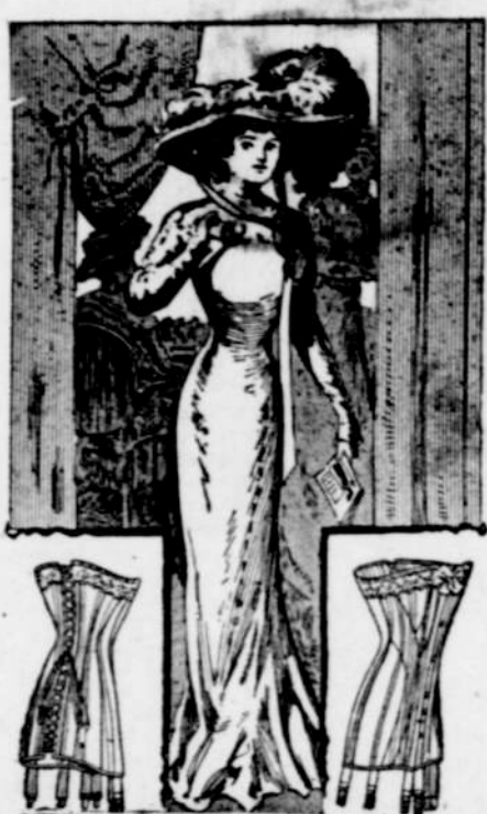
Copyright 1909 Kabo Corset Co. Kabo Style 1104. One of our latest straight up and down models with moderately high bust and extremely long, round skirt, made of very strong basket with beautiful embroidery trim, finished with ribbon bow, 1 1/2 inch front clasp, 3 pair strong suspender web hose, supporters, white only. Sizes 15 to 25. Price, $5.00

HERE'S a corset that has style enough about it to suit the woman who wants things "just so" and still it isn't so extreme as to be "freakish."