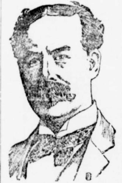
SIR THOMAS LIPTON.

New York, Oct. 25.—Declaring he had come "red hot for another challenge to the New York Yacht club," for another chance to lift the America's cup, Sir Thomas Lipton arrived