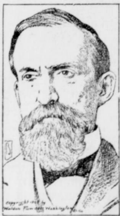
JOHN W. KERN.

Indianapolis, Ind., Nov. 4.—John W. Kern, the Democratic candidate for vice president, will probably go to the United States senate to succeed Hemenway, according to returns to-