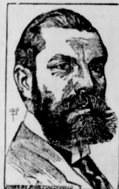
CHARLES EVANS HUGHES.

Berlin, Nov. 4.—The newspapers issued extra editions. The result was