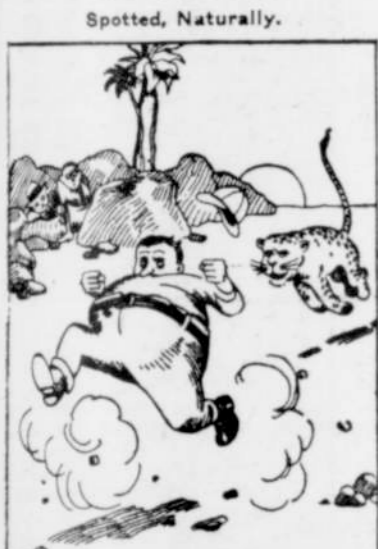
Spotted, Naturally. First Colored Gentleman—What a race! Wonder if you could spot the winner, Jim? Jim—The winner is spotted already.

Complete External and Internal Treatment for Every Form of Infantile, Childhood and Adult Eczema, Scabies, Itch, Pruritus, etc. Cuticura Ointment (50c) to Heal the Skin, and Cuticura Soap (25c) to Purify the Blood. Sold Everywhere. Write for Free Book on Skin Diseases.