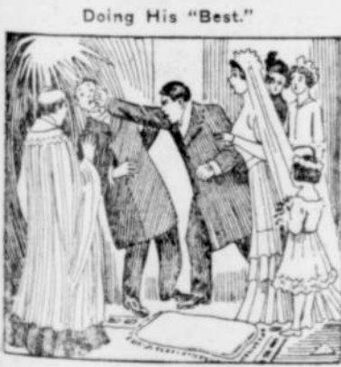
Doing His "Best."

Positively cured by these Little Pills. They also relieve Distress from Dyspepsia, Indigestion and Too Hearty Eating. A perfect remedy for Dizziness, Nausea, Drowsiness, Bad Taste in the Mouth, Coalited Stool, Pain in the Side, BRUISED LIVER, They regulate the Bowels. Purely Vegetable. SMALL PILL. SMALL DOSE. SMALL PRICE. Beware of cheap imitations. The Genuine Must Bear Fac-Simile Signature.