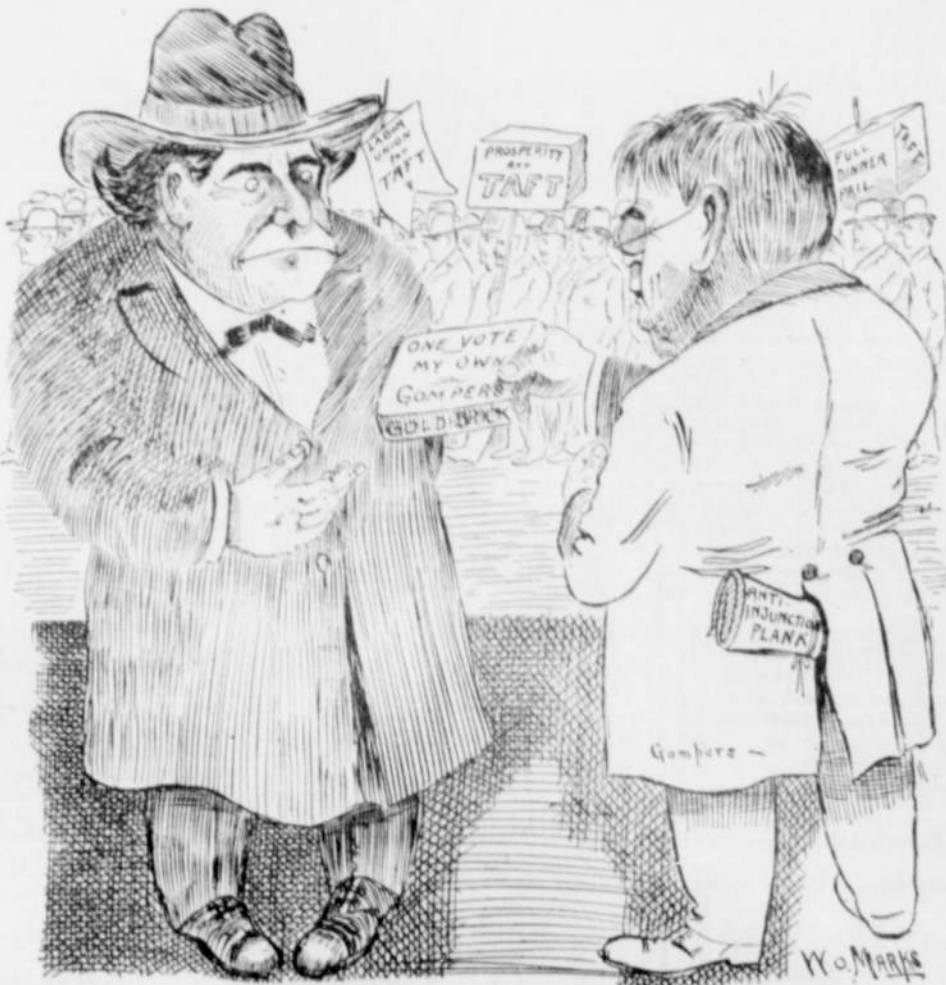
Gompers Delivering Labor's (One) Vote.