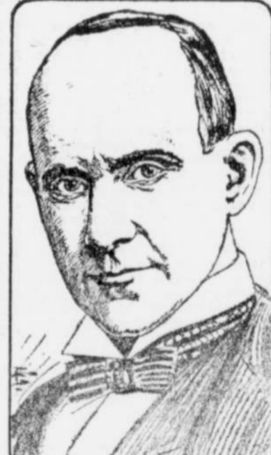
EUGENE V. DEBS.

not getting back in wages the full value of the production of this country, cannot buy back the production. The capitalist class, that is, the employing class, is too small in number to use up the difference, because with the aid of machinery production has greatly increased.