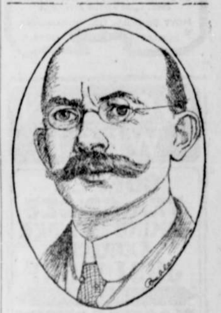
CHARLES W. BRYAN. Brother of William J. Bryan, who will aid in running the Democratic presidential candidate's campaign.

I shall, in the near future, prepare a more formal reply to your notification, and, in that letter of acceptance, will deal with the platform in detail. It is sufficient, at this time, to assure you that I am in hearty accord with both the letter and the spirit of the platform. I endorse it in whole and in part, and shall, if elected, regard its declarations as binding upon me. And, I may add, a platform binding us to what it omits as well as to what it contains, and an official is not at liberty to use the authority vested in it to contain. According to the democratic idea people think for themselves, and select officials to carry out their wishes. The voters are the sovereigns; the officials are the servants employed for a fixed time and at a stated salary to do what the sovereigns want done, and to do it in the way the sovereigns want it done. Platforms are entirely in harmony with this democratic idea. A platform announces the party's position on the questions which are at hand to urge personal views which have not been submitted to the voters for their approval. If one is nominated upon a platform which is not satisfactory to him, he must, if candid, either decline the nomination, or, in accepting it, propose an amended platform in lieu of the one