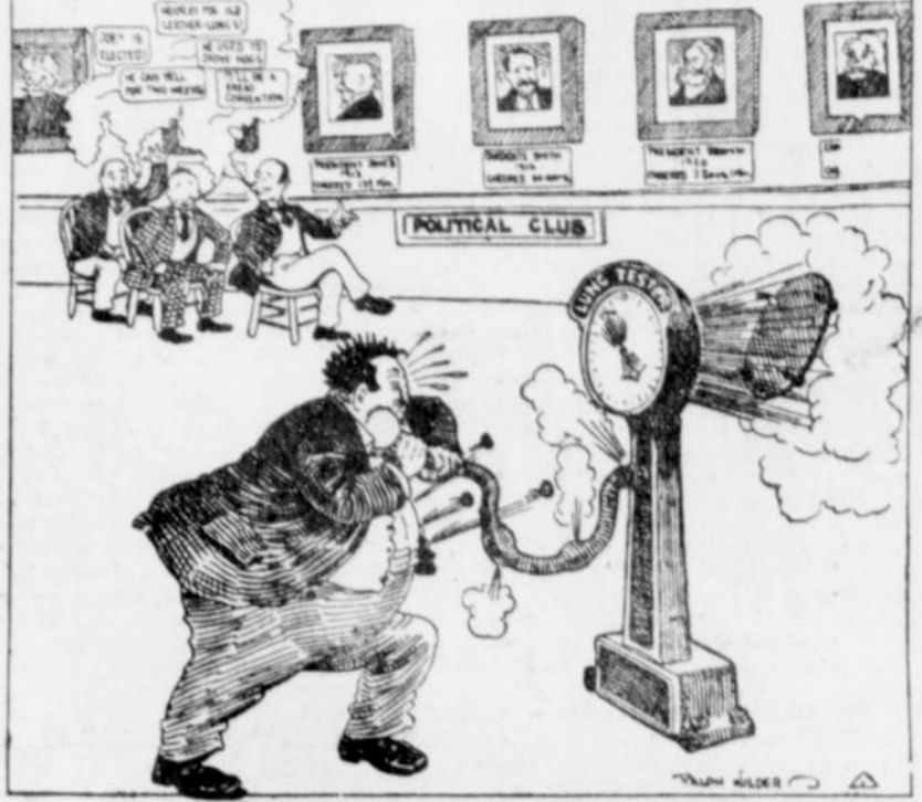
PROBABLE METHOD OF SELECTING DELEGATES. —Wilder in Chicago Record-Herald.