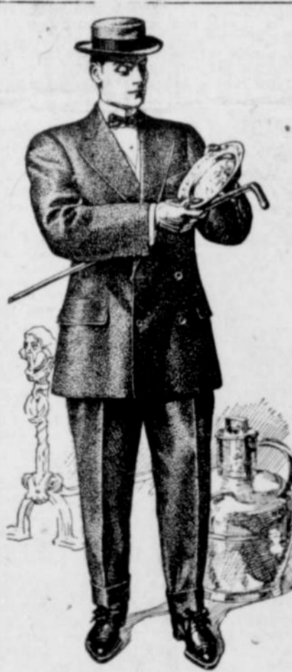
Copyright 1908 by Hart Schaffner & Marx