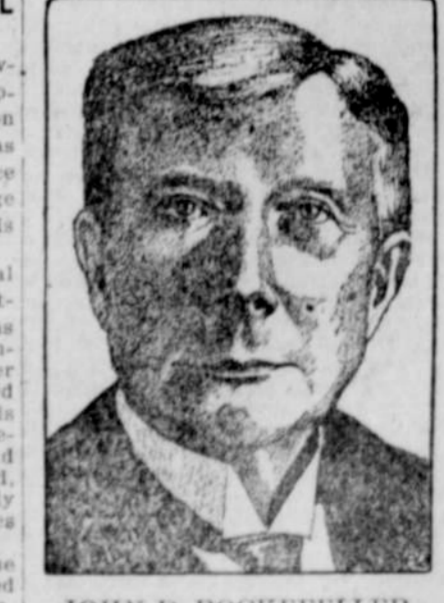
JOHN D. ROCKEFELLER

in the extensive chain of sites already filed upon. As stated by The Guard a few days ago, a crew of engineers has already begun to make the surveys for some of these canals, and it is probable that construction work on a number of them will begin in the not far distant future.