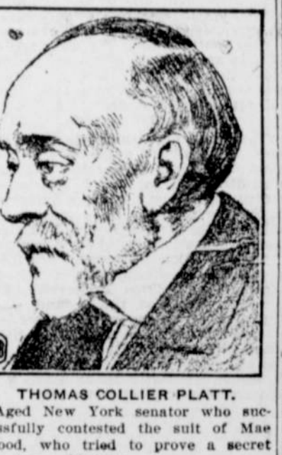
THOMAS COLLIER PLATT.

publican organization in New York State, for nearly 30 years a dominant factor in the party's deliberations in the Nation, the aged Senator has now put politics behind him, and broken in health, his power gone, he has withdrawn from his apartments, where