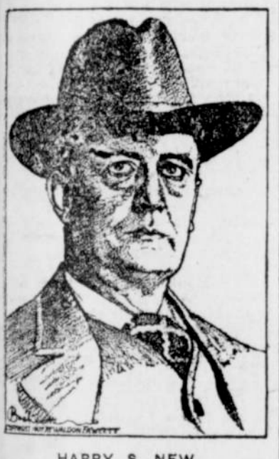
HARRY S. NEW.

Six of the seven dry counties that voted to continue prohibition gave the cold water treatment a majority of 2,485. The anti-saloon program was approved by 9,227 voters, while 6,742 expressed a desire to restore the dramshops. This majority will be further increased by the vote in Curry county, which is reported to have given the temperance forces a good margin.