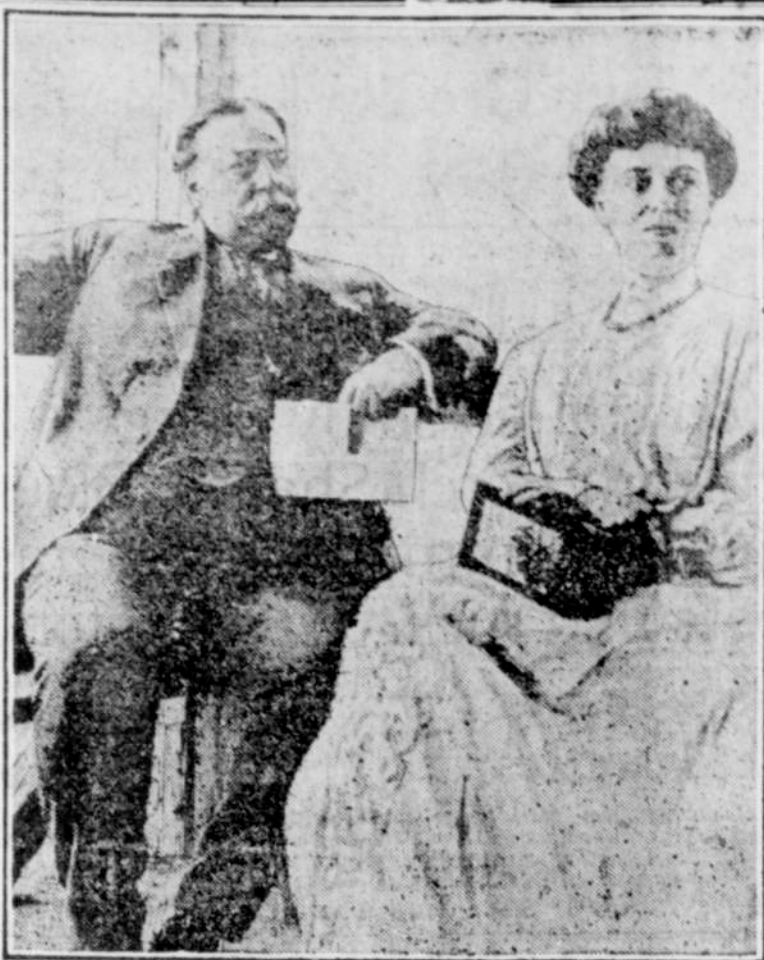
MR. AND MRS. WILLIAM H. TAFT.

Cures dizzy spells, tired feelings, stomach and liver troubles, keeps you well all summer. That's what Hollister's Rocky Mountain Tea will do. Try it and you will always buy it. 25 cents, tea or tablets. Linn Drug Company.