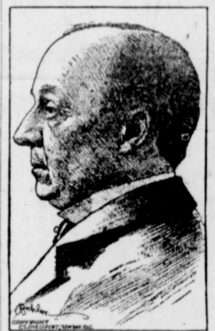
PHILANDER C. KNOX.

Umatilla county sheepmen have 100,000 sheep for sale, and as buyers seem to be very scarce they are petitioning the forestry department for permission to run them in the forest reserves this summer.