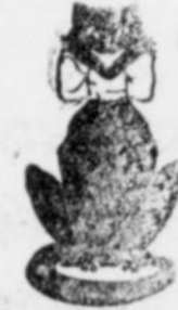
Black Cat Brand Chicago-Kenosha Hosiery Company, Kenosha, Wis.

BLACK CAT HOSIERY FOR MEN, WOMEN AND CHILDREN. AT MATLOCK'S. 586 WILLAMETTE ST.