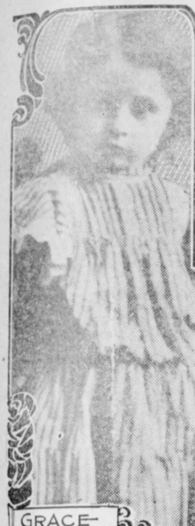
Pe-ru-na in the Home.