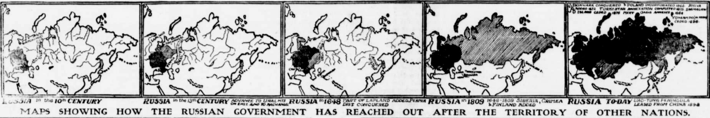
MAPS SHOWING HOW THE RUSSIAN GOVERNMENT HAS REACHED OUT AFTER THE TERRITORY OF OTHER NATIONS.