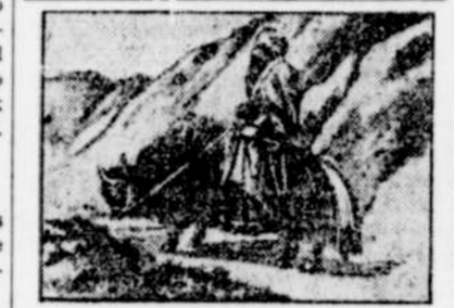
A MOUNTED LAMA.

For centuries Tibet has been almost a sealed book to the rest of the world, and the result of the expedition under Col. Younghusband, which the British have sent into the region, will be watched with interest. The high priests, or lamas, of Tibet have ever denounced the foreigner as an incarnated devil, and they preach that so long as Tibet remains isolated from the rest of the universe, so long shall she be great. A few missionaries and explorers have wandered across the borders of this great tableland, clambered up some of its snow-clad mountains, and visited a few of its stone cities; yet the greater part of its 650,000