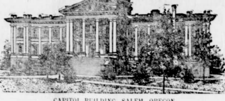
CAPITOL BUILDING, SALEM, OREGON.