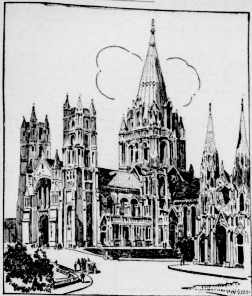
CATHEDRAL OF ST. JOHN THE DIVINE, WITH ST. PATRICK'S CATHEDRAL ON THE RIGHT, SHOWING THEIR RELATIVE SIZES.

Some time during the last half of the twentieth century—possibly at the dawn of the twenty-first—the Cathedral of St. John the Divine, in New York City, will be formally dedicated. This, the most remarkable building of the western hemisphere, marks the entrance of the United States upon an era of cathedral construction in the manner and the spirit of the cathedral builders of old Europe. For this cathedral is to be comparable in cost, size and beauty with the grandest of the ecclesiastical piles of the old world.